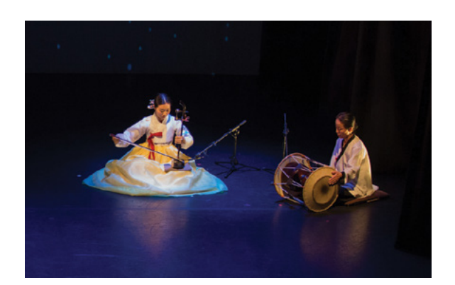
Korea Day at Nottingham Lakeside Arts (2018)