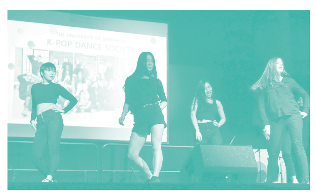
Korea Day at the Octagon Centre, Sheffield (2018)

'Korea Day' is a touring programme that brings Korea to UK cities. In 2018, numerous cultural programmes filled the Octagon Centre in Sheffield and Nottingham Lakeside Arts with a unique Korean vibe, these included traditional Korean costumes, games, handicrafts, calligraphy as well as Korean food and Korean make-up sessions.