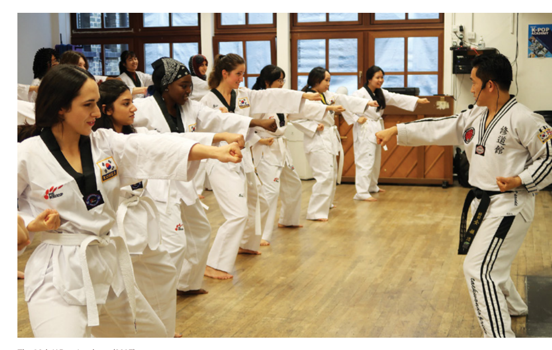
The 13th K-Pop Academy (2017) Taekwondo Class