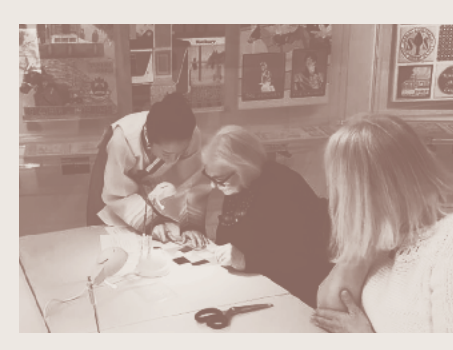
Patchwork culture class at Sunbury Embroidery Gallery (2017)

In the UK, there are presently three branches of the King Sejong Institute, these are operated by the KCCUK, SOAS University of London and the Korean Education Centre UK. The Korean language course at the KCCUK is a social education course that not only teaches the Korean language but also introduces Korean culture to students. The course includes a wider introduction to all aspects of Korean culture and the basics of Korean.