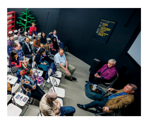
Korean Novels on Screen (2018)

In 2018, the Korean Novels on Screen programme features a series films, old and new that are based on novels by Korean writers.