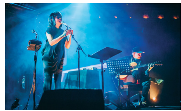
Youn Sun Nah, K-Music Festival (2016)

With many exciting collaborative projects in the programme, K-Music continues to produce unique events with UK artists, as well as exhilarating experiments that combine western and eastern sounds.