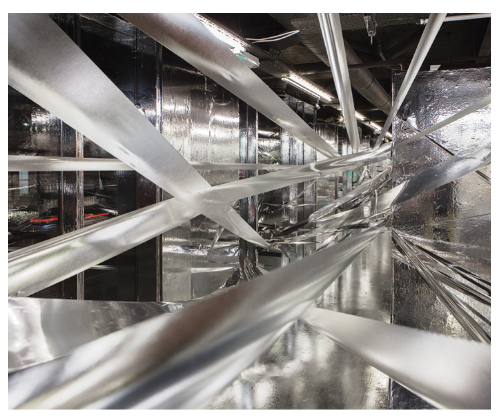
Lee Bul, Artist of the Year (2014) Preview Night, Installation view