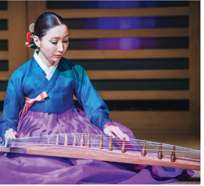
Korean Sounds (2017)