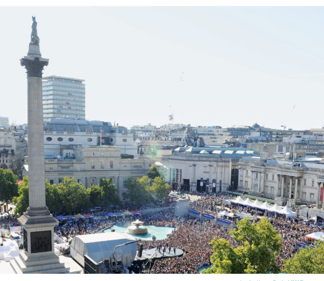
London Korean Festival (2015)