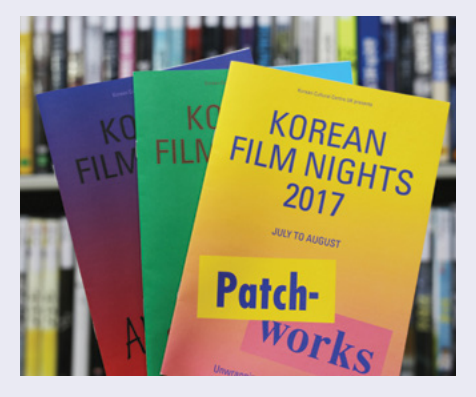
Korean Film Nights programme brochures (2017)