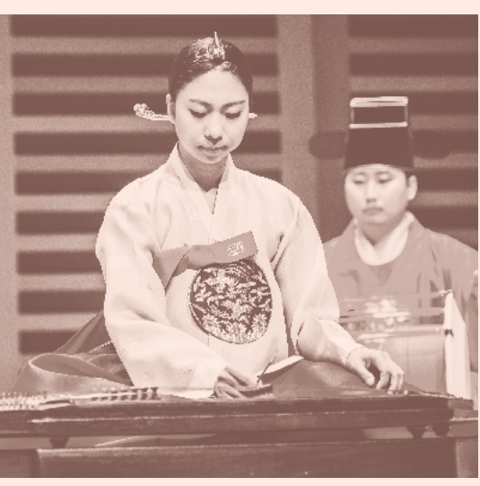
Korean Sounds (2016)