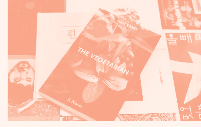
Korean literature

Korea has always had a robust market for literature, with each generation creating a new stand-out author or poet. In the UK, with the 2014 London Book Fair's Market Focus on Korea the British publishing industry was formally introduced to Korean literature.