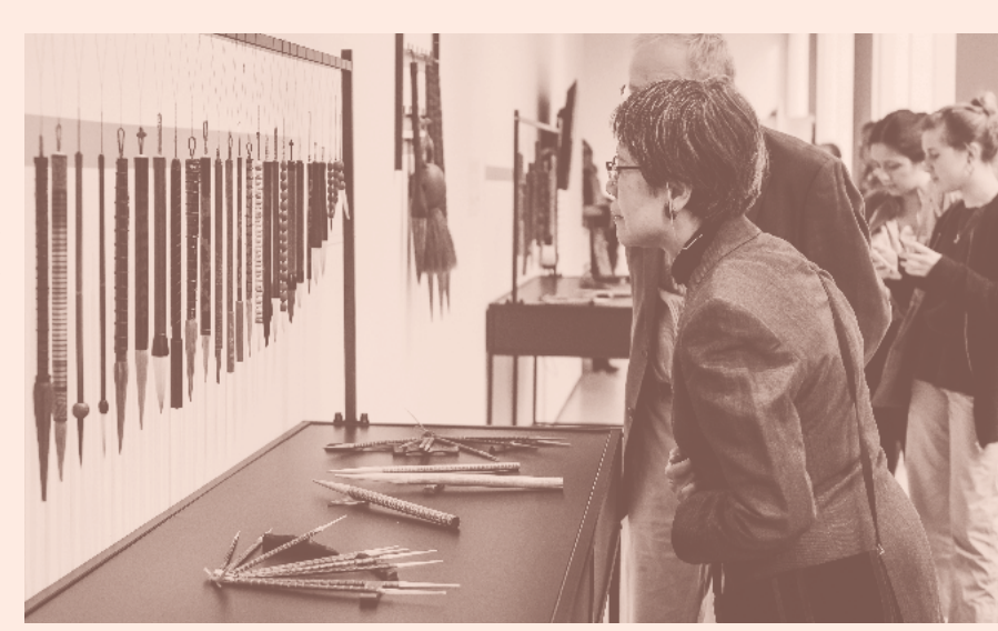
Munbangsau Exhibition (2018)