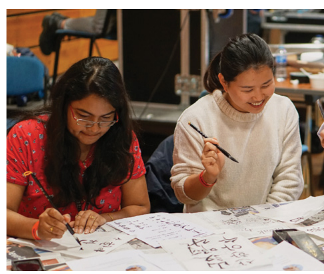
Korea Day at the Octagon Centre, Sheffield (2018)